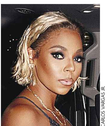
Pop star Ashanti